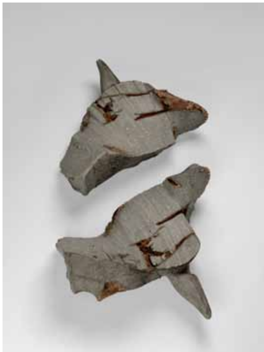
Photo Florian Kleinnefen Courtesy of the artist and Galerie Chantal Crousel, Paris © Jean-Luc Moulène © Adagp, Paris 2016