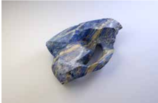
Photo Florian Kleinfenn Courtesy of the artist and Galerie Chantal Crousel, Paris © Jean-Luc Moulène © Adagp, Paris 2016

Monsieur Propre jusqu'à l'os Paris, 2016