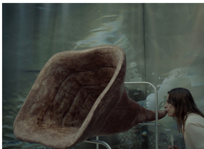
Dead Fingers Talk , Laura Gozlan, 2021 © All rights reserved