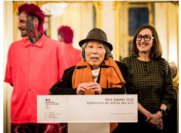
AWARE Prize 2025 Ceremony