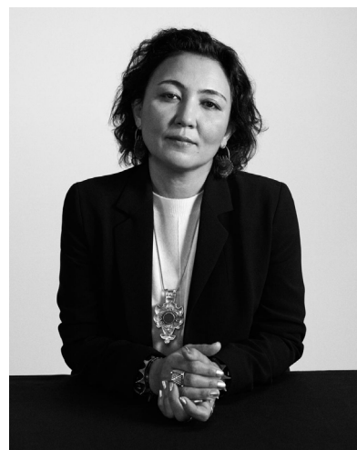
Portrait of Saodat Ismailova

Saodat Ismailova is an artist and filmmaker based in Paris whose work weaves together personal and collective memories, myths, and rituals within everyday life, evoking the multiple histories of Central Asia. She studied at the Tashkent State Institute of Arts, at Fabrica, and at Le Fresnoy – Studio national des arts contemporains. She has recently held solo exhibitions at Pirelli HangarBicocca (2024–2025), at the EYE Filmmuseum (2023), and at Le Fresnoy – Studio national des arts contemporains (2023). Her work has been presented at the Venice Biennale (2013, 2022), at documenta fifteen (2022), as well as at major international film festivals. In 2021, she founded DAVRA, a collective dedicated to cultural knowledge and research on Central Asia.