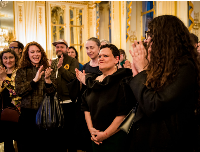
AWARE Prize 2025 Ceremony