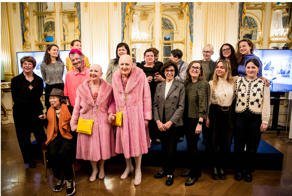
AWARE Prize 2025 Ceremony