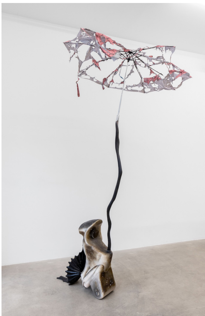
Some like it hot , Laura Gozlan, 2014 © All rights reserved