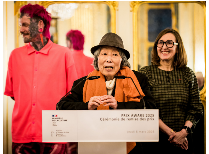
AWARE Prize 2025 Ceremony